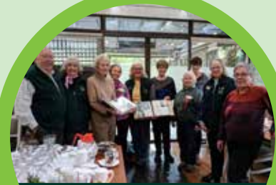
40 th Annual Plant Sale: Past and Present Chairs Celebrate

Thank you to the time and efforts of all our volunteers, your support creates a meaningful and lasting impact on our visitors and the community.