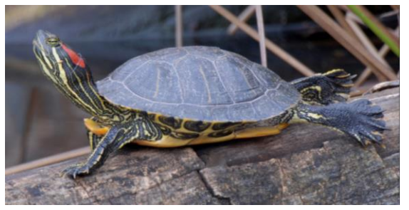
Red-eared slider. The non-native turtle species found in VanDusen ponds.