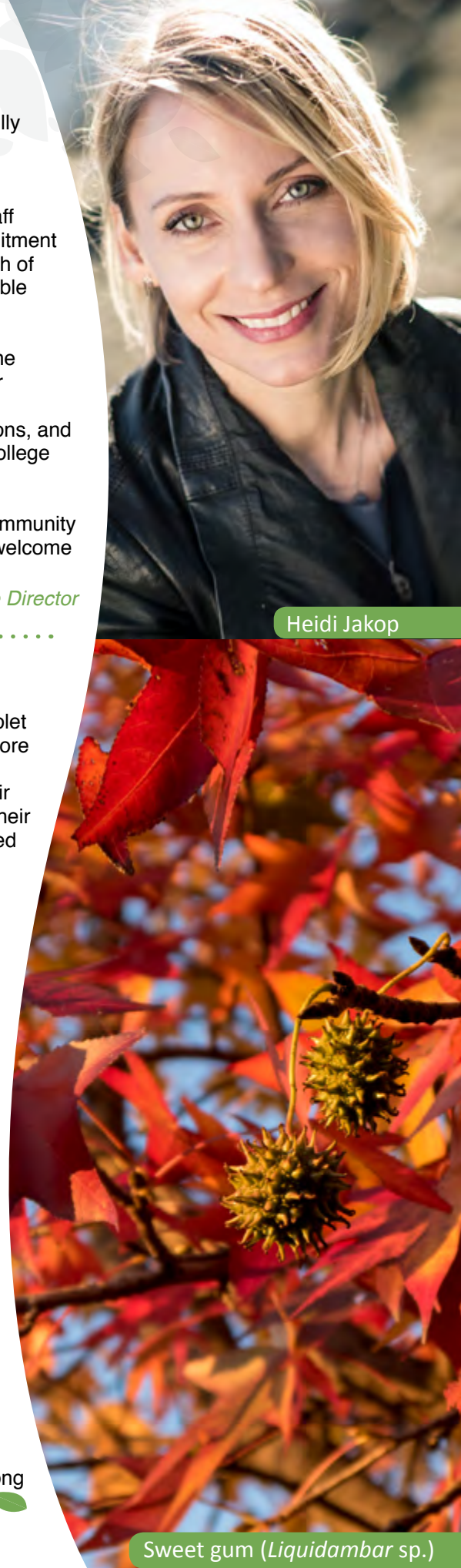
Sweet gum ( Liquidambar sp. )

VanDusen has several sweet gums in the Eastern North America collection, along the Autumn Stroll, in the Fern Dell, and at the foot of the Rhododendron Walk.