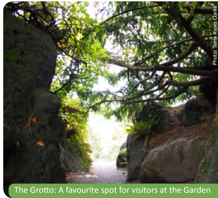
The Grotto: A favourite spot for visitors at the Garden

VBGA Staff news AGM & Volunteer Awards Teacher Pro-D Education ...and more