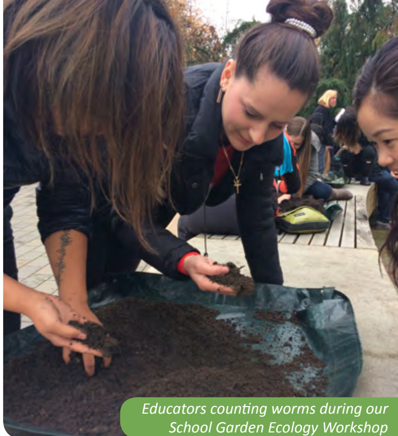
Educators counting worms during our School Garden Ecology Workshop

The combination of a beautiful, innately inspirational learning space (the Garden), and informed teachers can be particularly powerful, thus we have a responsibility to the youth of Vancouver to bring this to them. The VBGA embraces opportunities to show teachers how to use plants and gardens to open doors to discovery, and how to facilitate their students' learning from, and in, nature. BC's new educational curriculum provides one framework for this, as does our community's passion for organic food gardening.