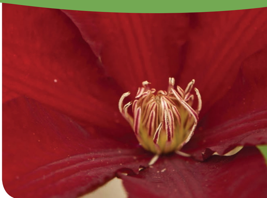
Clematis 'Rebecca'