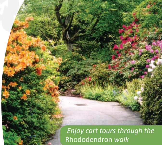
Enjoy cart tours through the Rhododendron walk