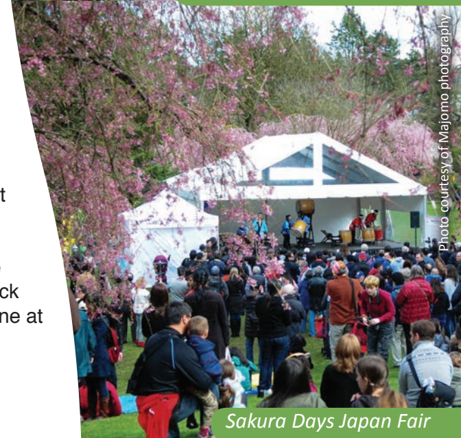
Sakura Days Japan Fair