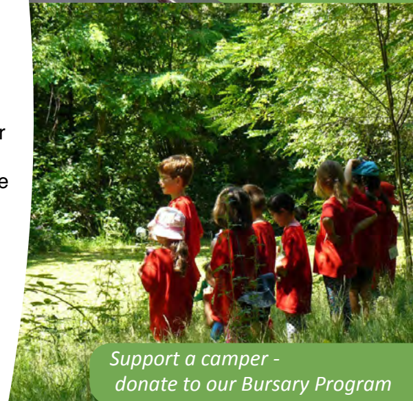
Support a camper - donate to our Bursary Program