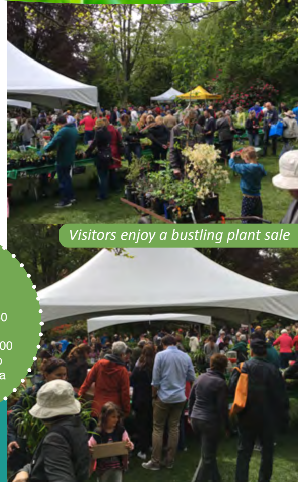
Visitors enjoy a bustling plant sale