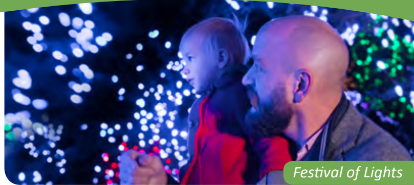
Festival of Lights