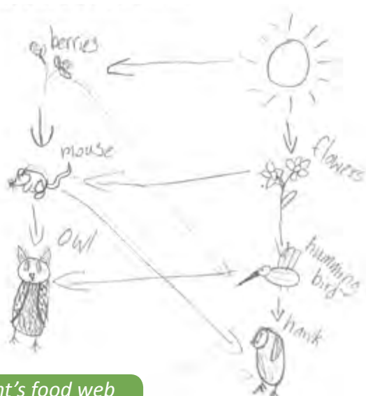
A student's food web

We are very grateful to the many donors that make our education programs possible, and accessible to everyone, regardless of financial restraints. Together, we are assisting children and their teachers and families in spending more time outdoors exploring gardens, forests, and other natural areas. Ultimately, thanks to your support, the VBGA is empowering them to make positive choices for the environment.